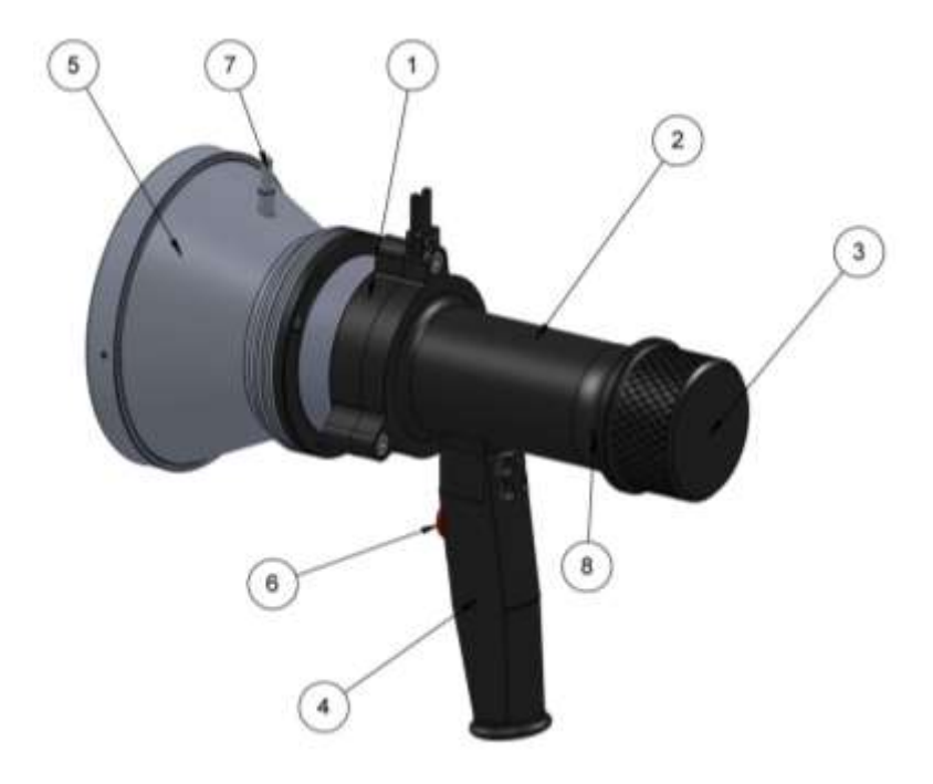
Figure 1: Flame Simulator Side View

The battery pack can be replaced easily by opening the back cover. This procedure must be executed in a safe area using only a SPECTREX battery pack, P/N 380004.